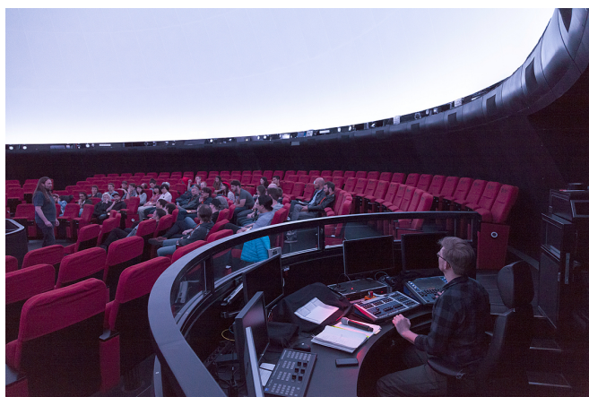
Fig. 2: Planetarium Hamburg. Note the dense horizon array (ring 1).

The playback system at Planetarium Hamburg is a 60.4 array arranged in 4 height layers plus one layer solely for the ‘‘Voice of God’’ loudspeaker, with a dense array in the horizon ring (nominally ear level) and rather sparse in the height layers (Fig. 2, Table 2).